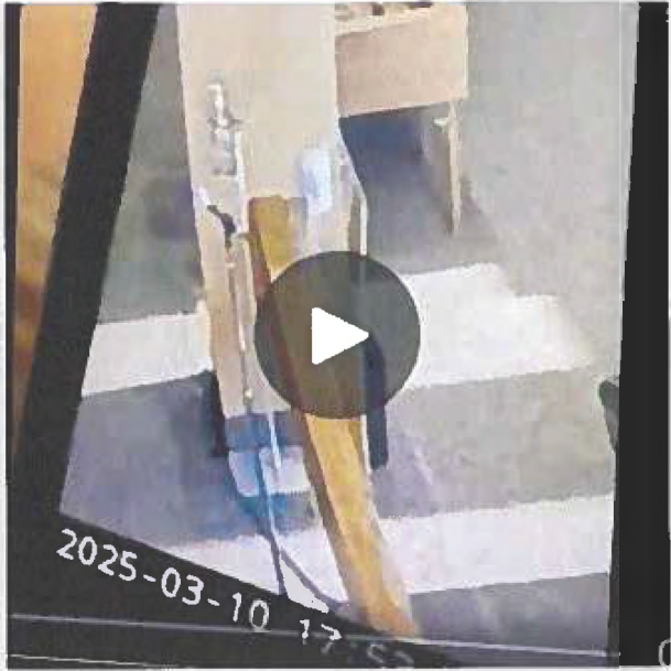
Garon Petty was live. | By Garon | Facebook facebook.com