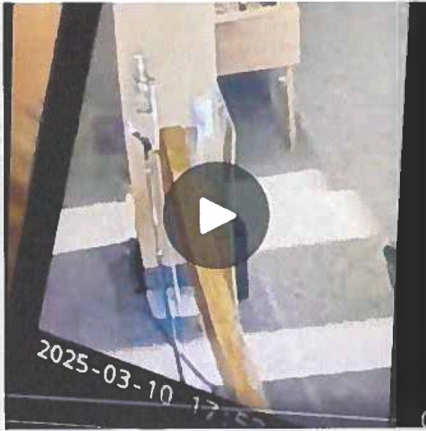
Garon Petty was live. | By Garon | Facebook facebook.com